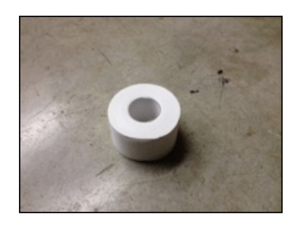
12"-14" of 1" diameter PVC pipe. This will become your handles. If you have large / wide hands you'll want to get a longer piece. The athletic tape is optional, but I prefer to wrap my handles for a better grip.