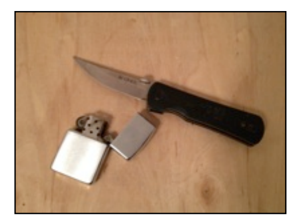
Knife & Lighter