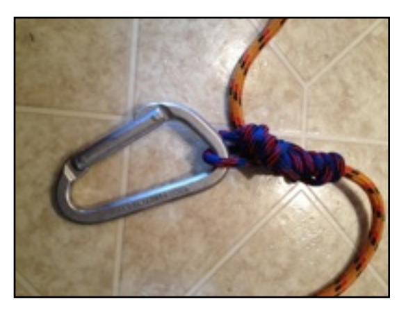
2 carabiners OR hardware store utility clips. For the workout described in YOU AND YOUR SUSPENSION DEVICE, a utility clip with a load tolerance of greater than half your bodyweight but less than your full bodyweight is acceptable. However, if you plan on advancing at some point to single-limb training, it is advisable to select clips with a higher load tolerance.